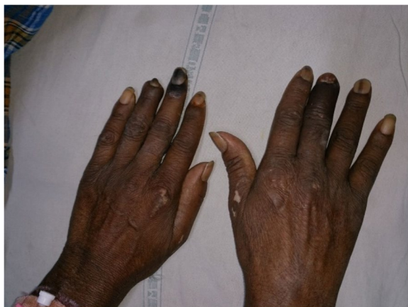
Fig. 1 Showing left middle finger gangrene and index finger .

peripheral pulses, blackish discoloration of fingertips of right and left middle fingers, and left ring finger (Fig. 1). He had multiple nontender, rubbery consistent lymph nodal swellings in bilateral cervical, axillary, and inguinal regions with the largest inguinal lymph node measuring 3 × 3 cm. Differential diagnosis of digital gangrene considered was Buerger's disease as the patient being a smoker, vasculitides, connective tissue disorders with vasculitis, antiphospholipid antibody syndrome, and malignancy with paraneoplastic manifestation/hypercoagulable state.