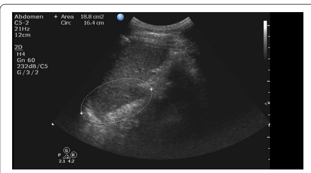
Fig. 1 Left upper quadrant view during a FAST (Focused Assessment with Sonography for Trauma) examination. A mildly hypoechoic crescent-shaped region is showcased (indicated by the outlined dashed oval area) medially to the upper half of the spleen (S), raising suspicion of a possible perisplenic hematoma

A 32-year-old male patient was brought to our hospital's emergency department following a low-energy motor vehicle accident. At the time of presentation, the patient was ambulatory, had a GCS of 15/15, and appeared hemodynamically stable with normal Hct/Hb blood counts. No clinical signs or symptoms of bleeding were noted, and no significant complaints were documented, besides minor tenderness over the left flank and overlying abrasions detected on physical examination. The patient's past medical history was insignificant. As per protocol, a FAST (Focused Assessment with Sonography for Trauma) scan was ordered. At the time of examination