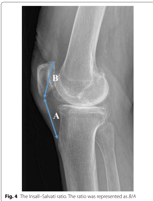
Fig. 4 The Insall–Salvati ratio. The ratio was represented as B/A

alignment, resulting in PF cartilage lesions. However, the exact mechanism of alignment-dependent PF cartilage lesions cannot be identified from the study results alone.