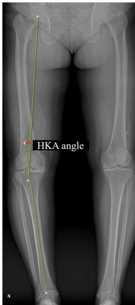
Fig. 3 Measurement of the hip-knee-ankle angle. The angle between the line connecting the center of the femoral head and the intercondylar center of the femur, and the line connecting the center of the tibial spine and the center of the talar dome was defined as the hip-knee-ankle angle

This study aimed to improve the symptoms of OA by analyzing the effect of the quadriceps muscle, which is one of the modifiable factors causing PF cartilage lesions. Among factors such as the direction, point of action, and magnitude of the quadriceps muscle force, the magnitude of the muscle force can be modified in elderly patients with medial knee OA, but not the direction or the point of action. However, in the present study, quadriceps muscle area and thickness did not affect the PF cartilage lesions in patients with medial knee OA. Among the analyzed