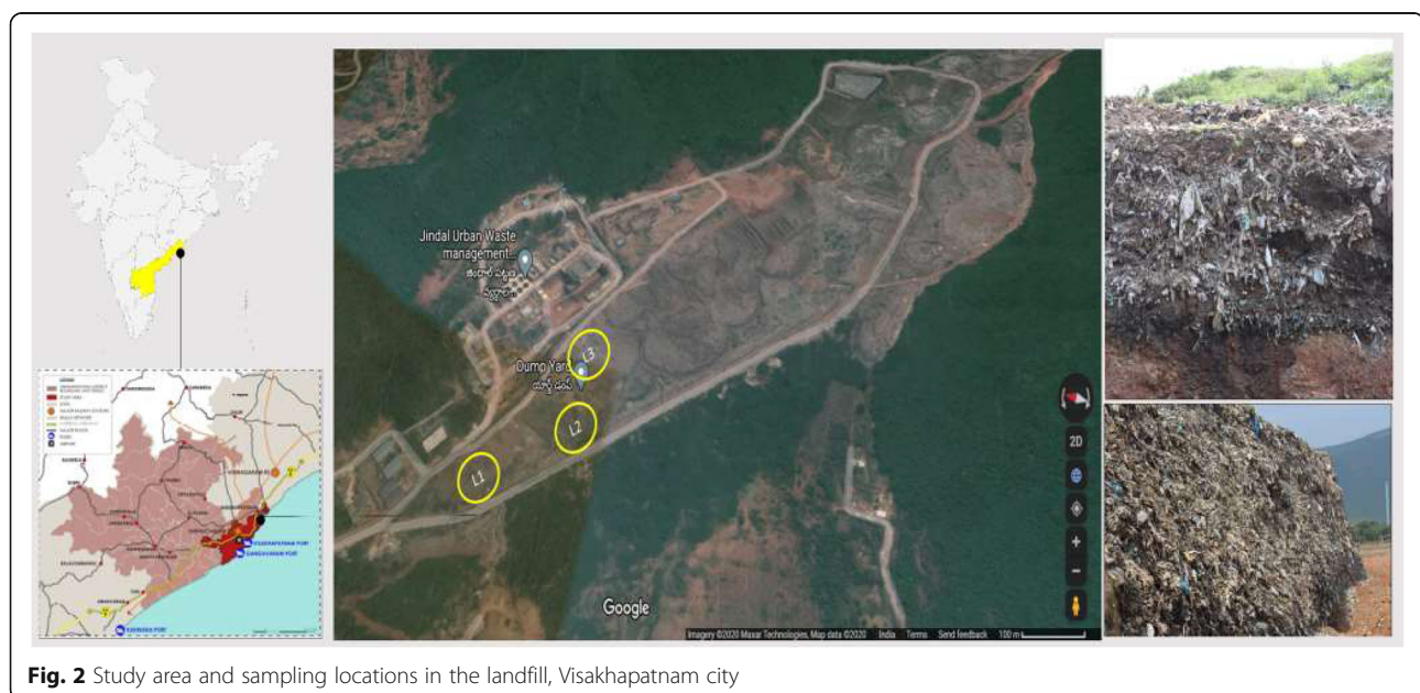
Fig. 2 Study area and sampling locations in the landfill, Visakhapatnam city

The samples collected were initially sieved through the 4.75 mm sieve to segregate the inert material. Retained sample waste mixed and placed in hot air oven for a period of 24–48 h at 70 \pm 2 °C. Dried samples were