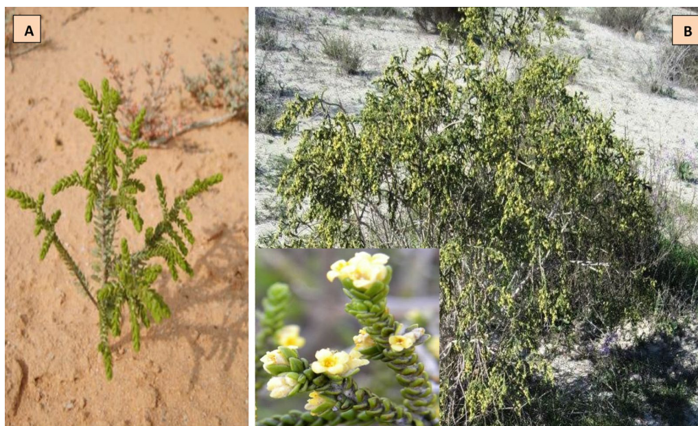
Fig. 1 Thymelaea hirsuta (L.) (Thymelaeaceae), A: a young plant on the inland depression, at El Omayed site; B: a mature plant at blooming stage on the coastal ridge at El Gharbaniat site

The two habitats are essentially unsuitable for agriculture although the local inhabitants are able to make a living under such conditions. The littoral dunes are extensively covered by rain-fed fig and palm trees, whereas the inland depression is used for herding sheep and goats. The stocking rate is estimated at one sheep per hectare, but the availability of grazing land changes from year to year depending on rainfall (Ayyad and Ghabbour 1977). The inland depression site is suitable for breeding