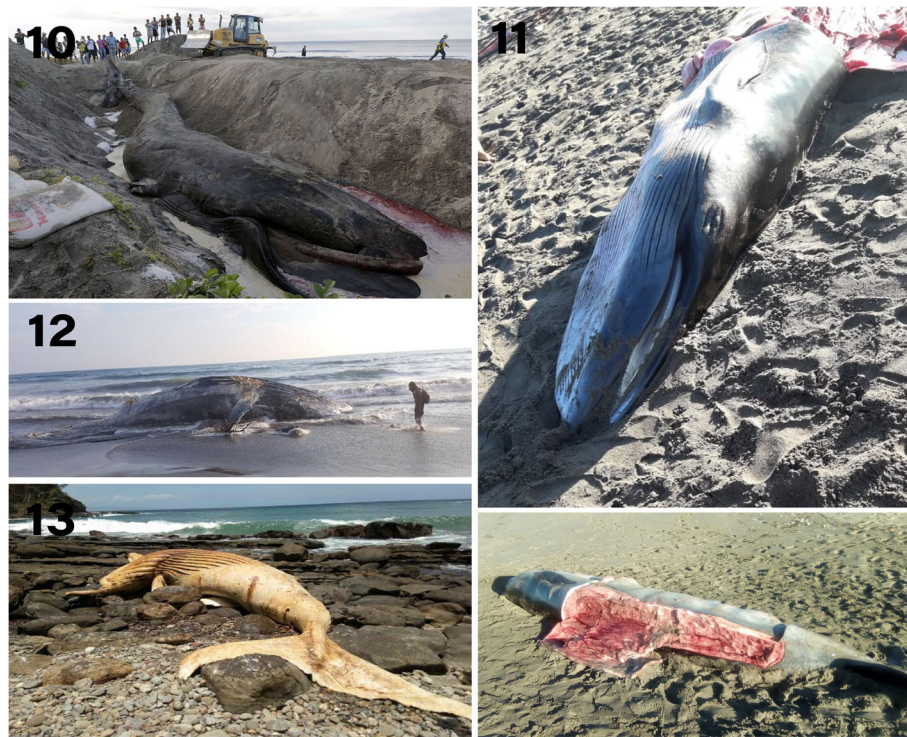
Fig. 4 Images of three species of cetaceans found stranded along the Pacific coast of Nicaragua from 2014 to 2021, Case 10: adult Balaenoptera musculus (photo credit : website); Case 11: juvenile Balaenoptera edeni (photo credit : website); Case 12 adult Megaptera novaeangliae (photo credit : Eddy Aluvin); Case 13 juvenile M. novaeangliae (photo credit : Damaris Obando)

available on this species' ecology in Central America. A stranded Bryde's whale, but usually exhibit offshore distribution patterns (Quintana-Rizzo 2017). In Oaxaca, Southern Mexico, four observations were made within coastal areas (Villegas-Zurita 2016). One stranding event of a 14 m-long female was documented in Playa Bandera, Costa Rica (Rodríguez & Cubero 2001) and another was in Guatemala (Cabrera et al. 2014).