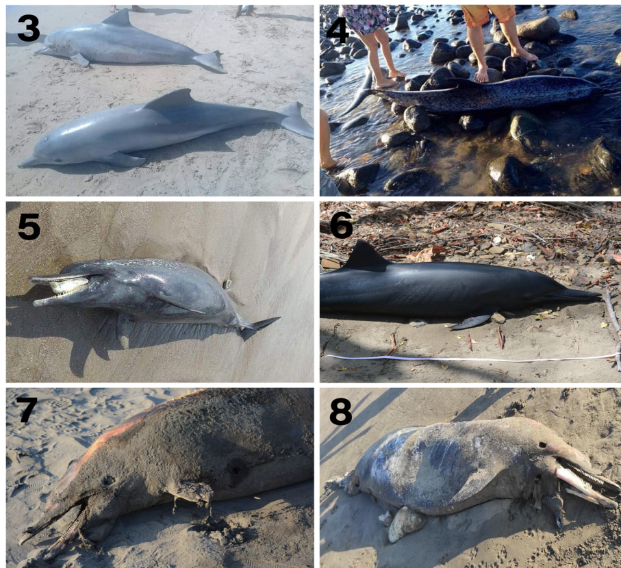
Fig. 2 Images of four species of cetaceans found stranded along the Pacific and Caribbean coast of Nicaragua from 2014 to 2021. Case 3: Sotalia guianensis; Case 4–5: Stenella attenuata; Case 6: Stenella longirostris; Case 7–8: unidentified delphinid

and was 150 cm long from snout to fluke; examinations of its surface revealed no lesions, wounds, or signs of a possible cause of death. The stomach contained some leftovers parts from fish, but the animal had apparently not eaten recently, as evidenced by the absence of undigested fish.