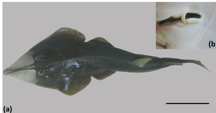
Fig. 2 Rhinobatos cemiculus collected from Kuşadası Bay, January 2015 (a) Total dorsal view, (b) left nostril (scale bar = 200 mm)