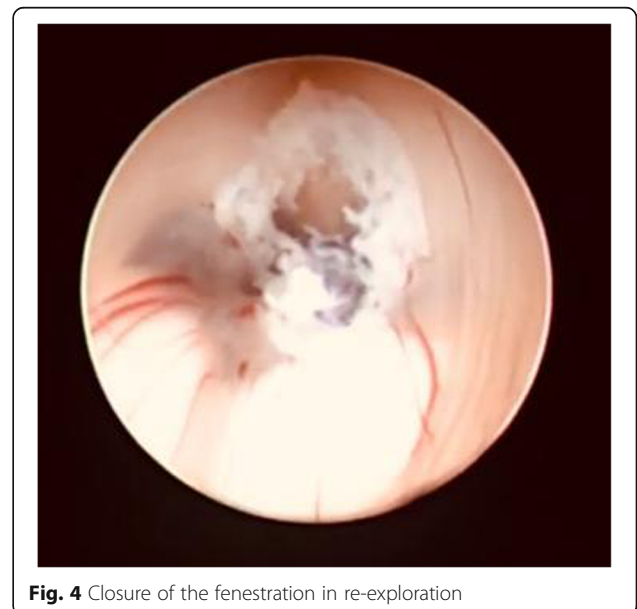
Fig. 4 Closure of the fenestration in re-exploration