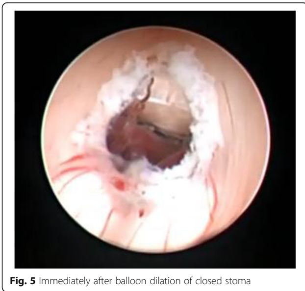
Fig. 5 Immediately after balloon dilation of closed stoma