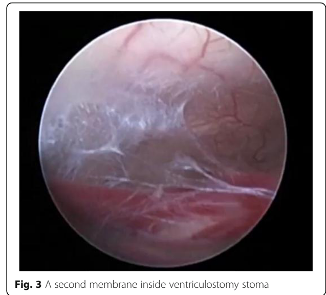
Fig. 3 A second membrane inside ventriculostomy stoma

This present study includes a total of 34 patients. Among them, 19 (56%) were male and 15 (44%) were female patients. We included patients between 2.5 months to 14 years in our study. The mean age of all patients was 51.25 \pm 53.90 months (range 2.5–168 months). All