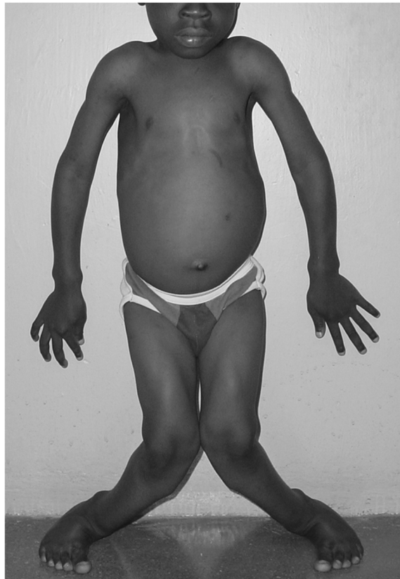
Fig. 1 Clinical signs of nutritional rickets. This Nigerian child has severe leg deformities, wrist enlargement, and enlarged costochondral junctions of the ribs

We participated in the Global Consensus Conference on the Prevention and Management of Nutritional Rickets and conducted a systematic review and grading of the evidence in the English language literature. The search strategy has been described in the