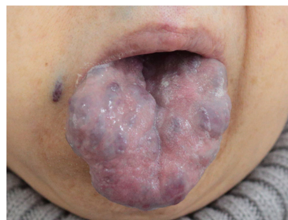
Fig. 1 Multiple hemangiomas on the tongue

With regard to airway evaluation, focused history taking and physical examination are essential, and use of a fiber optic bronchoscope is reasonable. Oral intubation is feasible, and video laryngoscope is useful for safe intubation [4, 5, 7]. Epidural anesthesia can be safely managed by paying attention to the possibilities of spinal canal lesions. MRI is the preferred modality for evaluating spinal canal involvement [8]. Although challenging, anesthesia can be safely performed in patients with BRBNS. Thorough preoperative evaluation based on the understanding of the nature of BRBNS is essential.