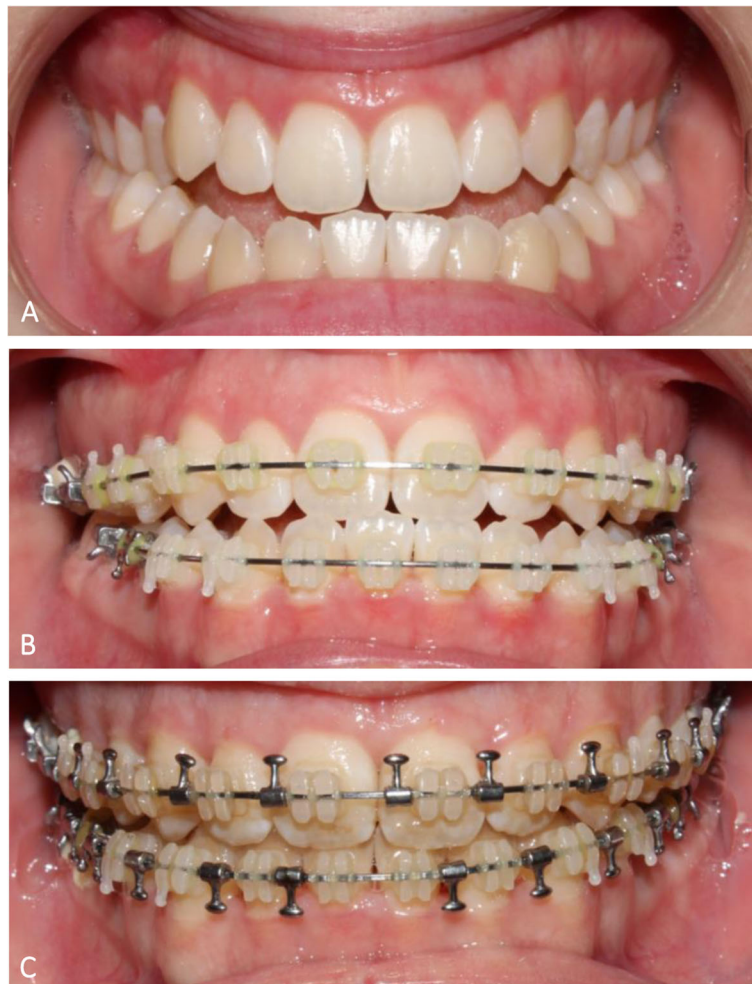
Fig. 1 Occlusion photos from A before orthodontics, B preoperative, and C 6 weeks postoperative

Prior to surgery, anesthesiology was consulted to plan safety measures in accordance with the patient's mandates. A baseline CBC showed a hemoglobin of 13.1 g/dl. She was started on iron and EPO. On the day of surgery, her hemoglobin was 16.8 g/dl. She underwent an uncomplicated surgery with a two-piece Le Fort I maxillary osteotomy and bone graft. Anesthesia was induced with sevoflurane, midazolam, fentanyl, propofol, and rocuronium. It was then maintained with sevoflurane, ketamine, propofol, and remifentanyl. Intraoperatively, she received a 1000-mg tranexamic acid bolus followed by a 1-mg/kg/h drip. A cell saver was not required but was immediately available. The estimated blood loss was 100 ml. Her hemoglobin on postoperative day 1 was 15.5 g/dl. She was