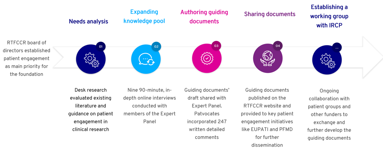
Fig. 1 Patient Involvement in Research initiative

with pharmaceutical companies and regulatory institutions on pharmaceutical products.