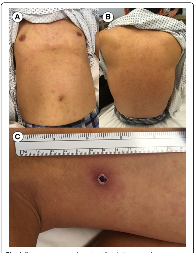
Fig. 1 Coarse maculopapular rash of South Korean patient, predominantly affecting the trunk (a, b), accompanied by characteristic necrotic eschar on the dorsal face of the left thigh (c)

A 62-year-old South Korean tourist presented with fever, rash, and severe malaise two days after arrival in Chile. He reported flu-like symptoms with chills, headache, and myalgia, which had begun five days earlier. The patient was from Seoul, but had recently visited a farm south of Seoul. At presentation, the patient suffered intense headache and felt severely unwell. He was tachycardic (108 bpm), had an axillar temperature of 38.8 C, and a generalized, non-pruritic maculopapular rash, more pronounced on the trunk and sparing palms, soles, and mucosa (Fig. 1, A and B). On his left posterior thigh, there was a painless necrotic lesion with a diameter of 6 mm and a surrounding red halo (Fig. 1, C). Complete blood count showed mild thrombocytopenia (91,000/ \mu L), low hemoglobin (13.0 g/dL), and normal leukocytes with a left shift (bands, 20%), toxic granulation, and atypical (reactive) lymphocytes. Other laboratory exams revealed elevated inflammation parameters (ESR, 32 mm/h; CRP, 3.6 mg/dL), slight hyponatremia (134 mEq/L), elevated hepatic enzymes (AST, 180 U/L; ALT, 161 U/L; GGT 327 U/L; AP, 208 U/L) and LDH (718 U/L). A molecular respiratory panel (xTAG® Respiratory Viral Panel FAST v2; Luminex, Austin, TX,