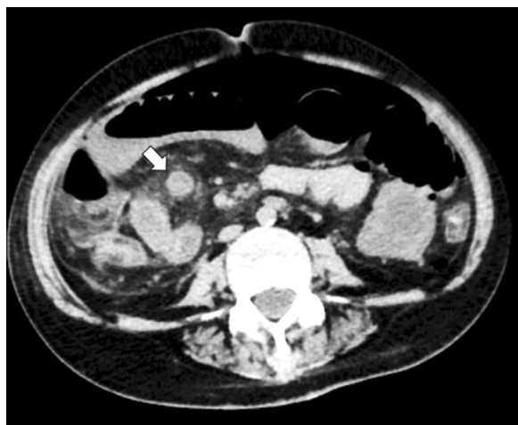
Fig. 1 Computed tomography coronal view image obtained free air and a right quadrant heterogeneous mass within the loop of ileum (close arrows)

Regarding the pathological findings, ectopic gastric mucosa was not observed in the diverticulum. The edge of the diverticulum wall consisted of a solid mass measuring 1.0 cm in size, and the tumor cells were spindle-shaped