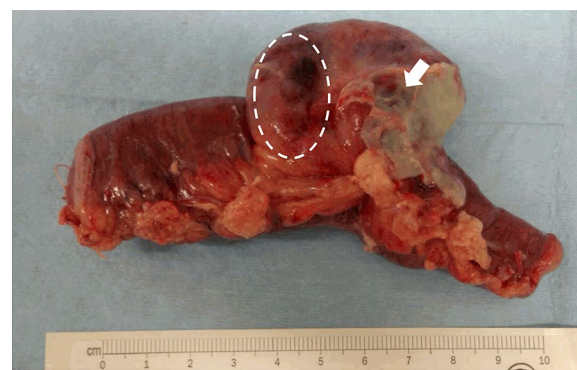
Fig. 2 Resected Meckel's diverticular mass with 5 cm margin of small bowel on either side of the lesion. The location of GIST was in the dotted line and perforation position of Meckel's diverticulum was located by the arrow

with 1 mitosis present per 50 high-power fields (Fig. 3a). The perforation site of the diverticulum was separated from the tumor nodule. The immunohistochemistry findings were as follows: the cytoplasm was stained positive for c-tyrosine kinase receptor (kit) (Fig. 3b) and \alpha -smooth muscle actin (Fig. 3c) and stained negative for CD34 (Fig. 3d). The Ki-67 index was 1.6%. The diagnosis was established as GIST of Meckel's diverticulum.