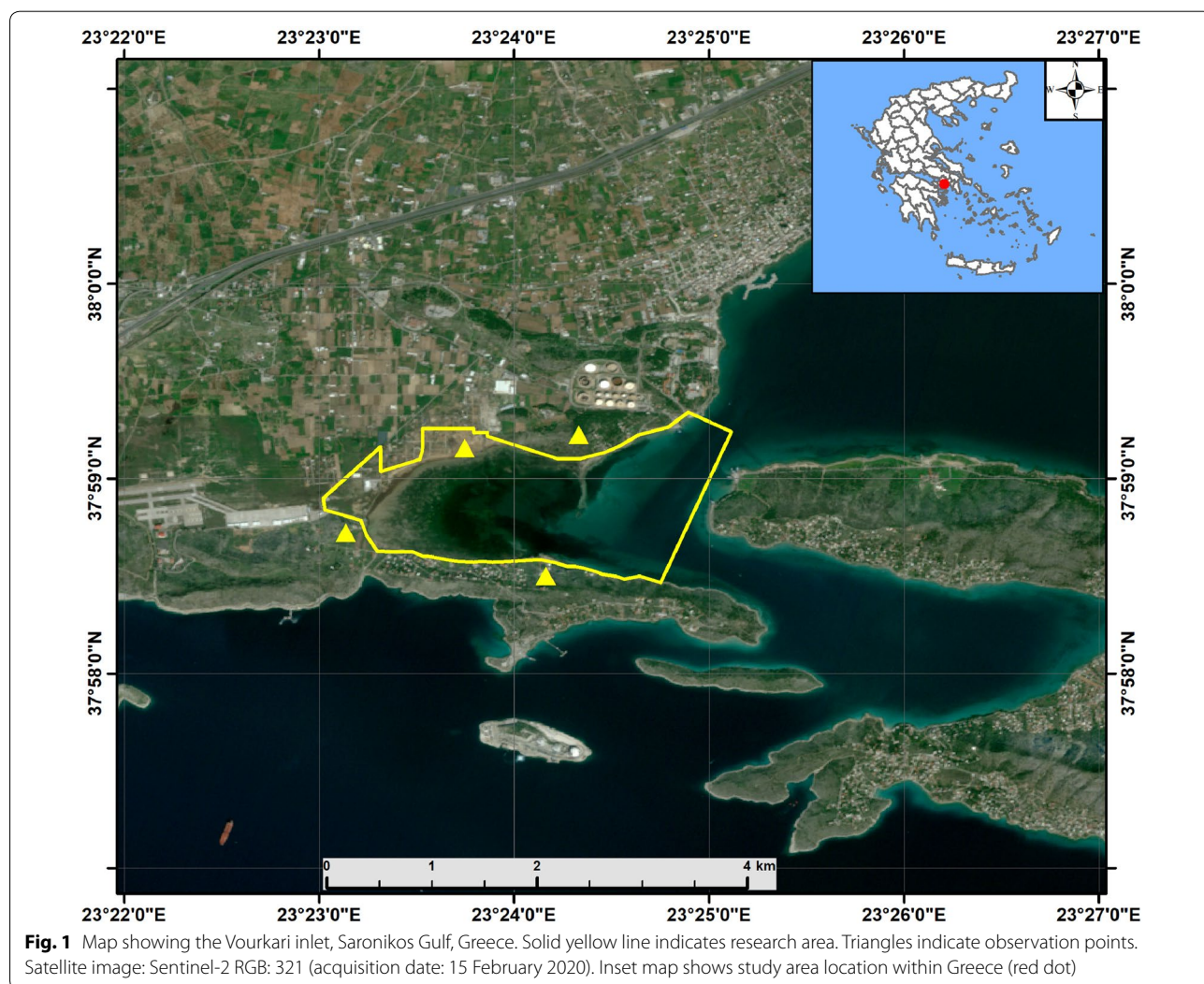
Fig. 1 Map showing the Vourkari inlet, Saronikos Gulf, Greece. Solid yellow line indicates research area. Triangles indicate observation points. Satellite image: Sentinel-2 RGB: 321 (acquisition date: 15 February 2020). Inset map shows study area location within Greece (red dot)

Vourkari inlet’s location within the most heavily populated and industrialized area of Greece posed high pressures on waterbirds and their habitats. Therefore, the