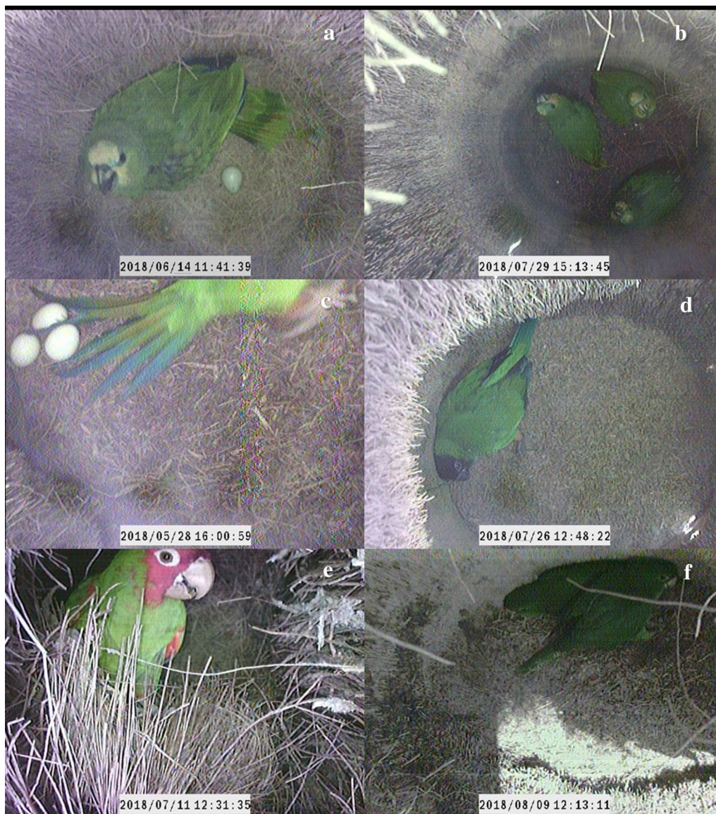
Fig. 1 Parrots nesting in tree cavities. Orange-winged Parrot incubating eggs (a) and near fledglings (b). Nanday Parakeet eggs visible behind tail feathers (c) and near fledgling (d). Red-masked Parakeet guarding eggs (e) and near-fledglings (f)

in more densely developed areas where Pileated Woodpecker cavities are less common. Parrots enlarged Red-bellied Woodpecker entrance holes 53.3% of the time, but only enlarged a Pileated Woodpecker hole in one of eight cases.