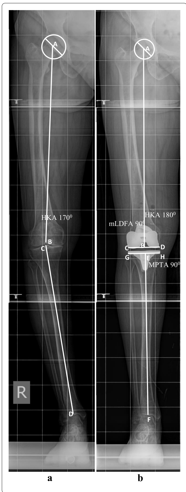
Fig. 1 a Preoperative standing LLR denoting the centre of femoral head (point A), centre of the distal femoral articular surface (point B), femoral mechanical axis (Line AB), centre of the proximal tibia/centre of tibial spine (point C), centre of the distal tibial articular surface, coinciding with midtalar groove (point D), HKA angle i.e. angle between line AB and CD is 168° or 12° varus. b Postoperative standing LLR denoting HKA angle, (angle between line AB and EF) 180°, mL DFA, angle ABC, 90° and MPTA, angle FEH, 90°

i.e., the line joining the point between the tibial spine/center point of the tibial base plate to the central depression on the dome of the talus; (ii) the mechanical lateral distal femoral angle (mL DFA), i.e., the lateral angle between the femoral mechanical axis and the tangent line connecting the distal femoral condyle preoperative and femoral prosthesis postoperative; and (iii) the medial proximal tibial angle (MPTA), i.e., the medial angle between the tibial mechanical axis and the tangent line connecting the proximal tibial condyles preoperative and tibial component postoperative. The aim was to restore the mechanical axis classically within 3° of the neutral mechanical axis (HKA axis 180±3°).