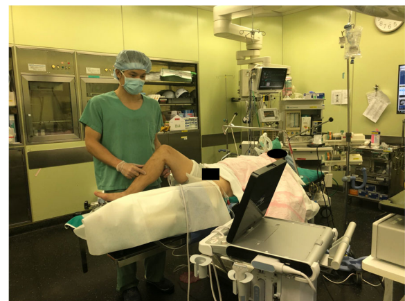
Fig. 1 Preoperative setting and ultrasound evaluation in the operating room

There are various treatment options available for popliteal cysts. While various studies have reported that