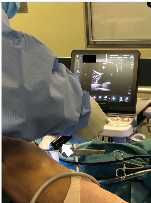
Fig. 3 A contrast dye (indigo carmine, broad white arrow) is injected into the popliteal cyst (star) percutaneously using ultrasonography. The 23-gauge needle (narrow white arrow) is clearly visible on the ultrasound screen

conservative management of popliteal cysts results in a high rate of cyst persistence [12, 22], ultrasound-guided percutaneous treatment (ultrasound-guided puncture, aspiration, and corticosteroid injection) is one of the few acceptable treatment options, with a recurrence rate of 12.7%. We prefer this conservative treatment as an initial strategy. Historically, open surgery has been widely performed; however, the recurrence rate has been high, ranging from 42% to 63% [6, 8, 24]. In addition, there are concerns about cosmetic issues, wound pain, and wound complications due to the larger wound size.