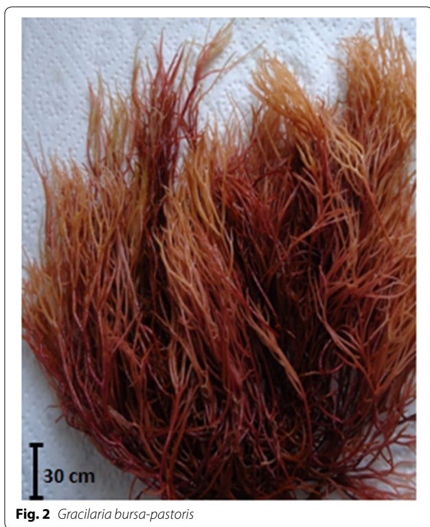
Fig. 2 Gracilaria bursa-pastoris

with ultrapure water. In the third step, after 30 min of incubation at room temperature, we measured the absorbance at 760 nm. Gallic acid was used for the calibration curve. All the results were expressed as Gallic acid equivalents (mg GAE/g dry weight of the extracts) according to the following equation: