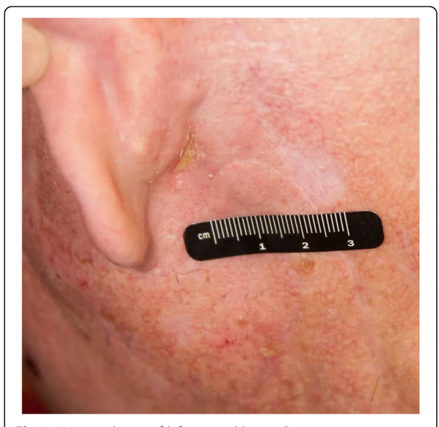
Fig. 2 Near-resolution of left mastoid lesion. Pre-treatment image documentation was not obtained