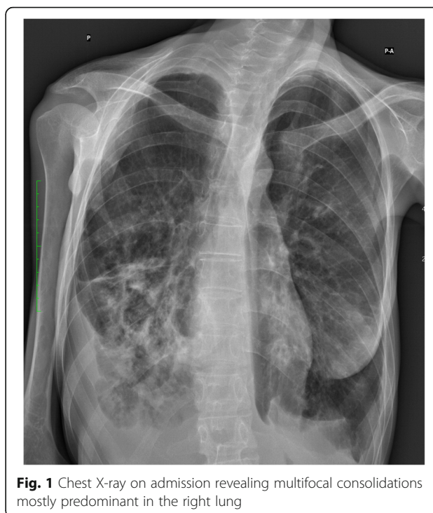
Fig. 1 Chest X-ray on admission revealing multifocal consolidations mostly predominant in the right lung

She was admitted to the internal medicine ward and treated empirically with ceftriaxone and levofloxacin. Blood cultures and sputum samples were collected before antibiotic administration and came back negative a few days later. Bronchoalveolar lavage (BAL) samples collected during bronchoscopy came back negative, and tuberculosis was ruled out after several test panels; mycological cultures turned out negative as well. Cystic fibrosis was considered as another differential diagnosis option, but the tests had also negative results (CFTR gene test panel, twice). The patient's condition stabilized after a few days of nutritional and antibiotic therapy, and she left the hospital at her own request shortly after refusing talks with a psychiatrist. She underwent further treatment on an outpatient basis. Due to the chronic nature of the patient's ailment she was referred for a computed tomography (CT) scan of the chest. It revealed massive cylindrical and saccular bronchiectases, with