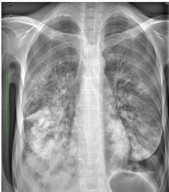
Fig. 3 Subsequent chest X-ray revealing a similar state of the right lung compared to the previous examination