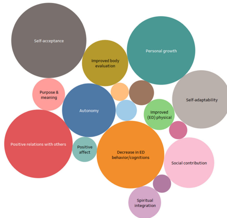
Fig. 2 Intensity effect sizes of criteria for recovery. Circles represent criteria for recovery and are based on the intensity effectsizes. The larger the circle, the larger the intensity effectsize. Circles that are labeled with a text have moderate, substantial or strong evidence for a recovery criteria. Circles that are not labeled with a text are the remaining criteria

adaptability/resilience as a criterion for ED recovery, fits this recently proposed definition of health [73]. In addition, Ryff stated that PWB is fundamentally anchored in how individuals face the challenges of life [62]. It is noted that “being recovered” is certainly not achieving a perfect state on the found criteria. It is explained as a unique and self-determined process by recovered individuals, without a clear endpoint [46, 74–79]. A new definition for ED recovery based on the latest definition of health and the results of this study could be: recovery from an ED is the ability to adapt and to self-manage in the face of social, physical and emotional challenges with an overall tendency towards growth in psychological well-being and adequate symptom remission (for instance as operationalized by Bardone-Cone et al. [18]). ED patients reported an overall impairment in PWB in a controlled study, which was not necessarily dependent on the presence of high levels of symptom severity, suggesting that PWB does not simply correspond to the absence of pathology [42]. Well-being and pathology as two different but related aspects of health has been well validated in several samples of the normal population and in patients [31, 36, 41].