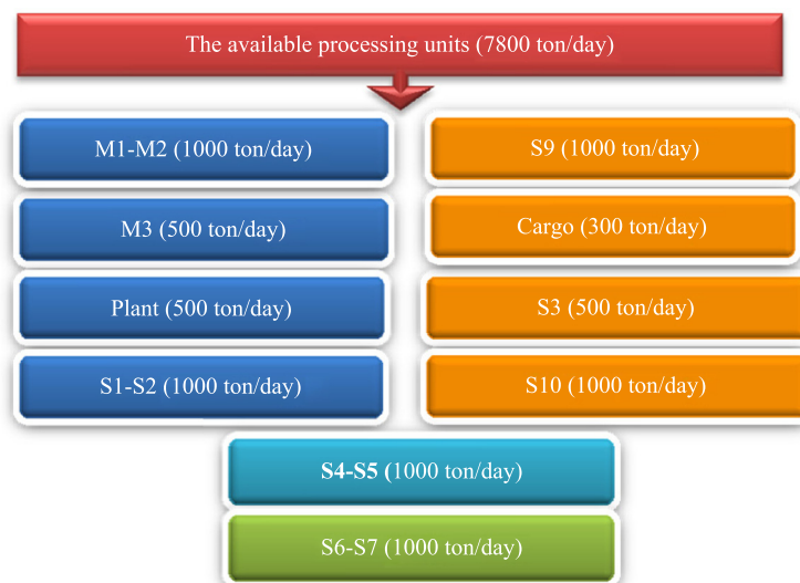
Fig. 3 Name and nominal capacity of solid waste processing units in Aradkooh

In order to determine the optimal status of the available system for Tehran's SWM system, after extraction