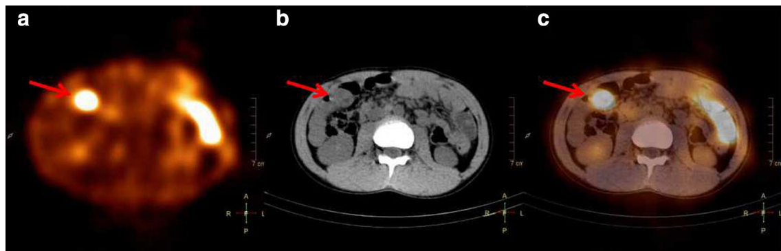
Fig. 3 Axial SPECT/CT image of the Meckel's diverticulum. a Axial image SPECT shows one focal concentration in the right abdomen (arrow). b CT demonstrated a blind-ending tubular structure in the right abdomen (arrow). Anatomical relationship between the focal concentration and right kidney cannot be identified. c Axial SPECT/CT fusion image showed that it was in front of the kidney that the focal concentration lays (arrows)