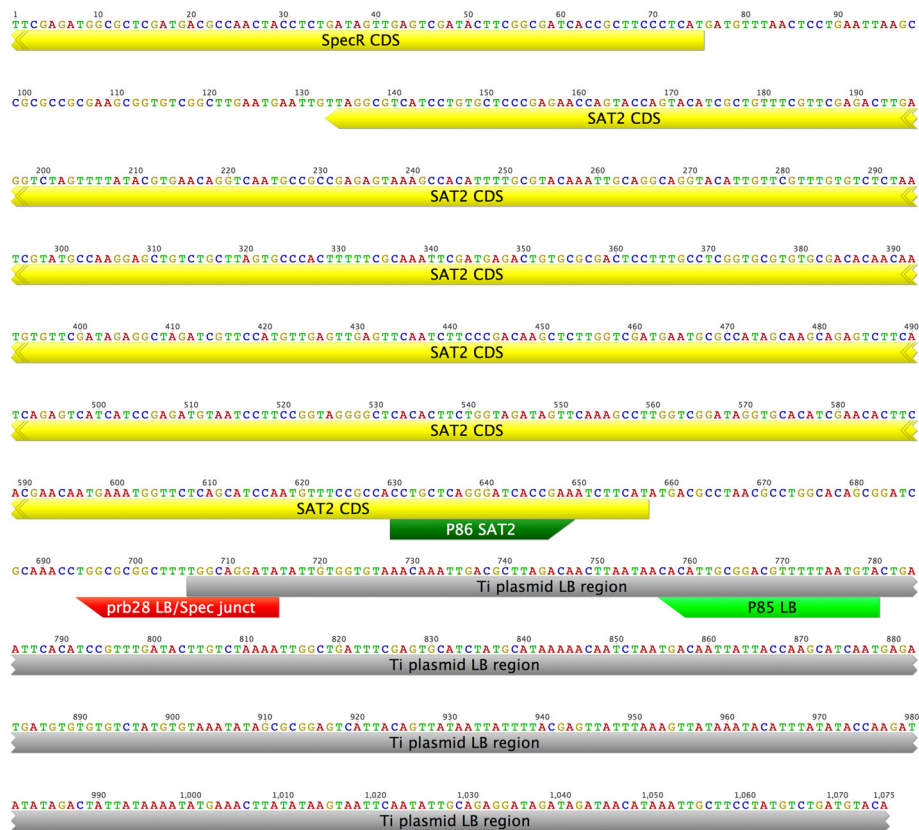
Figure 3 Sequence adjacent to the LB region in FP967 and SAT2-LB event specific assay. Our analysis indicated a region of the T-DNA between the NOS promoter of NPTII and SAT2 was duplicated between the FFS1 region of the flax genome and the LB of the T-DNA. A qPCR assay was developed to detect this event specific fragment (P85, P86 and prb28). The sequence of these primers and probe is indicated with green and red blocks, respectively. The location of the Spectinomycin resistance gene AADA and SAT2 are shown in yellow and the LB region in grey. The sequence of this fragment was confirmed by PCR sequencing of P30-P85 and P30-P20 fragments.

The assay developed contains a primer in the SAT2 gene (P86), one in the LB region of the T-DNA (P85), and a probe that spans the junction between these two components (prb28; Figure 1C). This qPCR assay only detects FP967 and not Norlin gDNA, even at a low stringency (54° annealing/extension in a two-step reaction). The assay was also tested on crude gDNA extractions from seedling hypocotyls and mixtures of DNA extracted from a single FP967 seed along with nine CDC Bethune seeds. The event-specific assay was able to detect the FP967 T-DNA in both of these admixtures (data not shown).