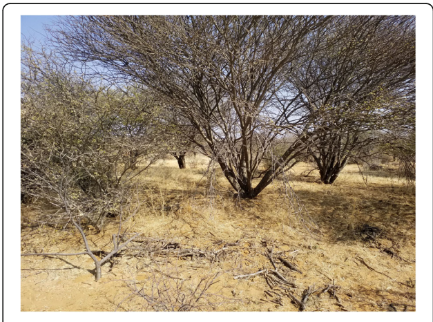
Fig. 3 Area close to the DTP in Ombooronde; photographed 12th August, 2020

Though these zones were perceived as approaching deteriorated/depleted, my informants generally highlighted the value of the annual grasses still growing in these spots, mentioning species such as omurondji ( Schmidtia kalahariensis ), oruejo ( Eragrostis porosa ), ehozu romarindi ( Urochloa beachyura ), and otjiramata ( Setaria verticillata ). Despite their short life cycle, these