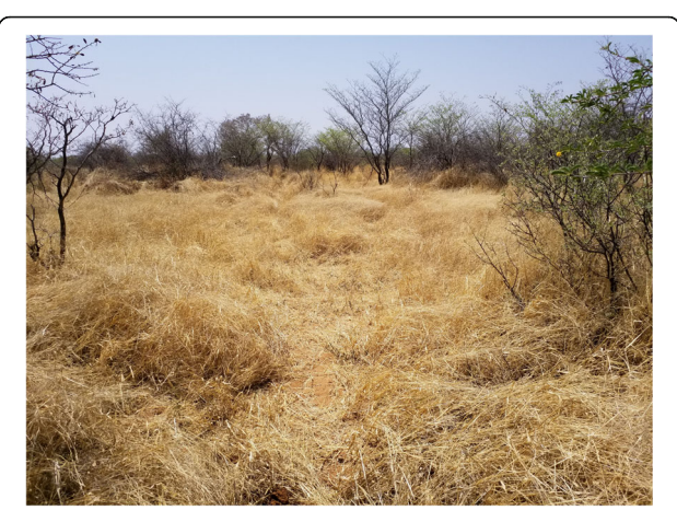
Fig. 2 Area far from the DTP in Ohamuheke; photographed 29th September, 2020

frequently used for grazing. These traits were pointed out by my interlocutors whilst describing the sites' main characteristics. Figure 2 gives a visual impression of one site, depicting one of the best grazing spots in Ohamuheke as indicated by 60-year-old Erenst Kazenaimue and his 40-year-old cousin Operi, both local residents<sup>12</sup>.