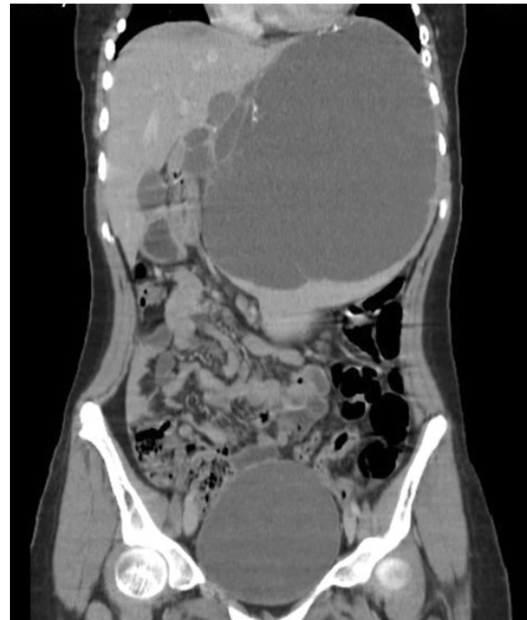
Fig. 1 Computed tomography scan revealing a giant cyst in the spleen

Surprisingly, the pathologist has turned the suspected impression into a simple splenic cyst.