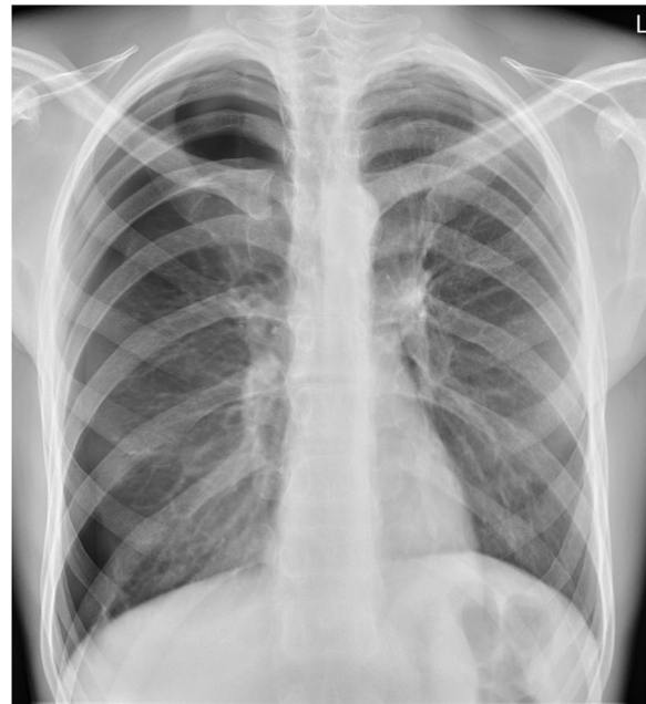
Fig. 2 Pneumothorax on right side. No sign of a significant mediastinal shift and thus no evidence of tension pneumothorax. No infiltrate

A African young man of 28 years and a body mass index (BMI) of 19 kg/m 2 presented for TB screening at Butha-Buthe District Hospital, Lesotho with a productive cough, chest pain, and night sweats starting 3 days prior to presentation. Other exhibited symptoms included fatigue, a sore throat, and rhinorrhea. No fever was reported. He reported no history of TB, previous lung disease, or other comorbidities. On presentation, the patient had a stable cardiorespiratory status, with all vital signs and oxygen saturation within normal range. On clinical examination, there were no signs of edema, dehydration, or enlarged lymph nodes. The SARS-CoV-2 PCR, Xpert MTB/RIF and Xpert MTB/RIF Ultra assays, as well as the TB LAM Ag Test all returned negative. The PA-CXR conducted at Butha-Buthe District Hospital revealed no signs of infiltration or pleural effusion, but a right-sided pneumothorax (Fig. 2; CAD4TB v7 score: 35.54). Hospital admission and intercostal drain placement were recommended as procedure by the study team. The hospital physician, however, opted for a conservative therapy. On the follow-up CXR, the pneumothorax had resolved spontaneously. The patient was in a stable state and was therefore discharged from the hospital.