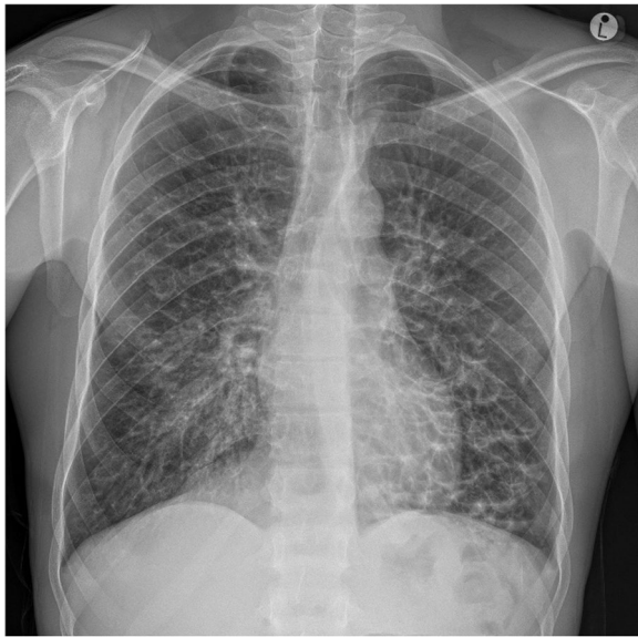
Fig. 3 Bilateral massive bronchiectasis with cystic appearance in the middle and lower fields, possibly related to recurrent episodes of bronchopulmonary infection

Upon follow-up 6 months later, the patient reported his general condition since enrollment as improved. He reported intermittent shortness of breath, dry cough, and tiredness. The previous 7 days, however, were symptom-free. Since enrollment in the TB TRIAGE + ACCURACY study, the patient has sought no medical care, and there is no treatment or future care planned.