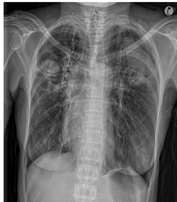
Fig. 4 Cavitation in right and left upper fields with solid content, potentially fungus balls/aspergillomas. Bilateral pleural thickening. No sign of infiltrates or pulmonary edema

was afebrile and comfortable on room air with SpO 2 of 98%, and her vital signs were within normal range with a respiration rate of 18 beats per minute. Her chest findings were equal chest expansion, hyperresonance to percussion bilaterally, air entry heard bilaterally but slightly decreased on the right posteriorly, and bilateral amphoric breath sounds with intermittent wheezing. The SARS-CoV-2 PCR and Xpert MTB/RIF and Xpert MTB/RIF Ultra assay results were negative. The TB LAM Ag Test, which detects the LAM antigen in urine, indicating active TB, was positive (1+). The capillary blood sample displayed neutrophilic leukocytosis with neutrophil levels at 76% (normal range 40–60%) and a total leukocyte count of 19.3 × 10 9 /L (normal range 4.0–10.0 × 10 9 /L). The CRP level was elevated at 53 mg/L. CD4 level was tested higher than 200 cells/μL. The PA-CXR revealed cavitation with solid content in the right and left upper field, in addition to bilateral thickening of the pleura, highly suspicious for aspergillomas (Fig. 4; CAD4TB v7 score: 61.7). The patient was called back the following week for an additional sputum and urine Xpert MTB/RIF Ultra, both without detection of Mycobacterium tuberculosis (MTB). The patient was then referred to the hospital outpatient clinic where the patient was known for many years.