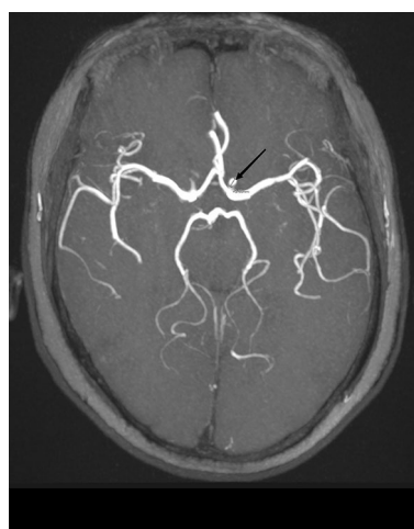
Fig. 2 Magnetic resonance angiography showing a 4-mm aneurysm located at the cavernous segment of the left internal carotid artery (black arrow)

The oculomotor nerve nucleus is located in the dorsal midbrain. The oculomotor nerve fascicle tracks through the red nucleus, exits ventrally, passes between the