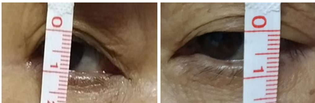
Fig. 1 Left ptosis of the patient