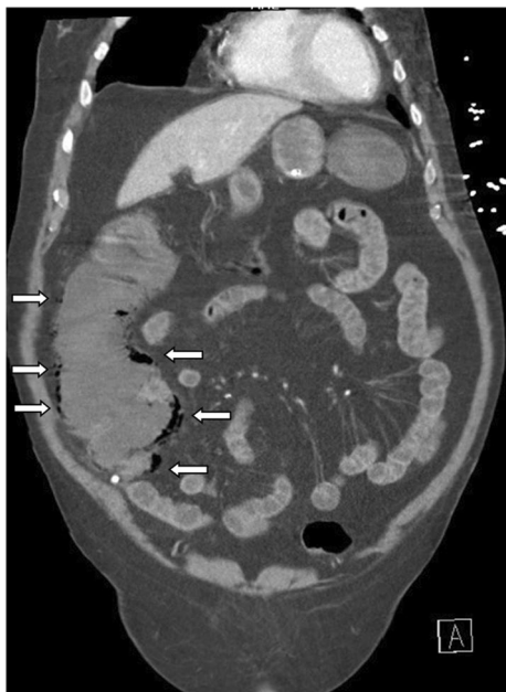
Fig. 2 Abdominal computerized tomography (CT) scan with pneumatosis intestinalis of the right colon (arrows) (soft tissue window)