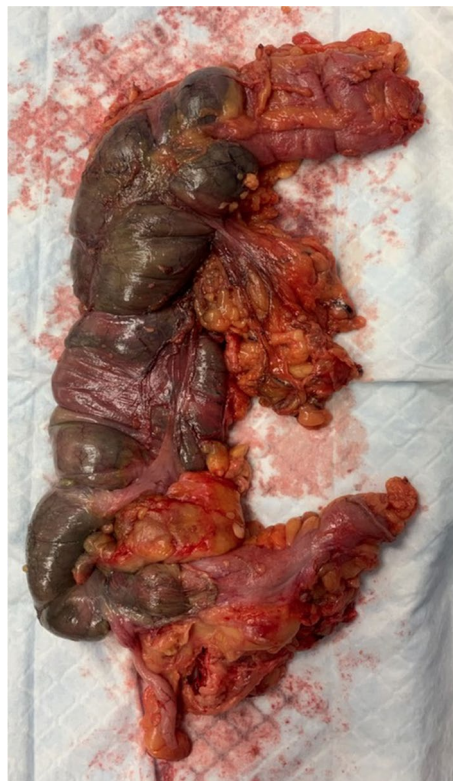
Fig. 4 Gross specimen showing a well-demarcated ischemia of the right colon