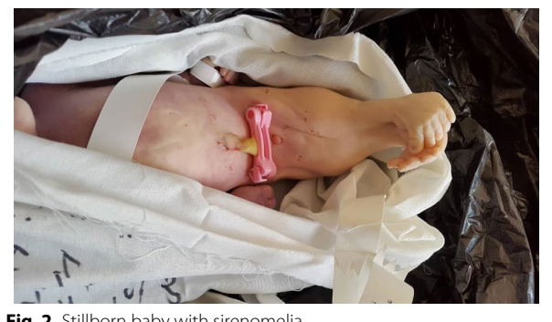
Fig. 2 Stillborn baby with sirenomelia

Eventually, the follow-up to her fourth pregnancy indicated that she gave birth to a normal baby.