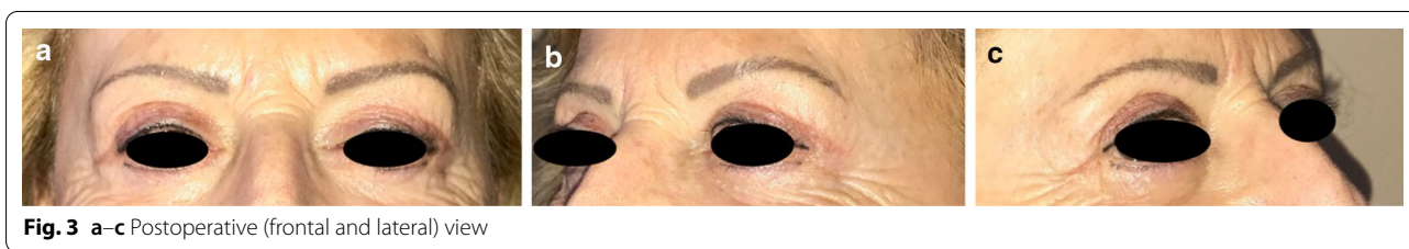
Fig. 3 a-c Postoperative (frontal and lateral) view

0 representing the lowest patient satisfaction and 100 representing the highest patient satisfaction [2] (Fig. 4).