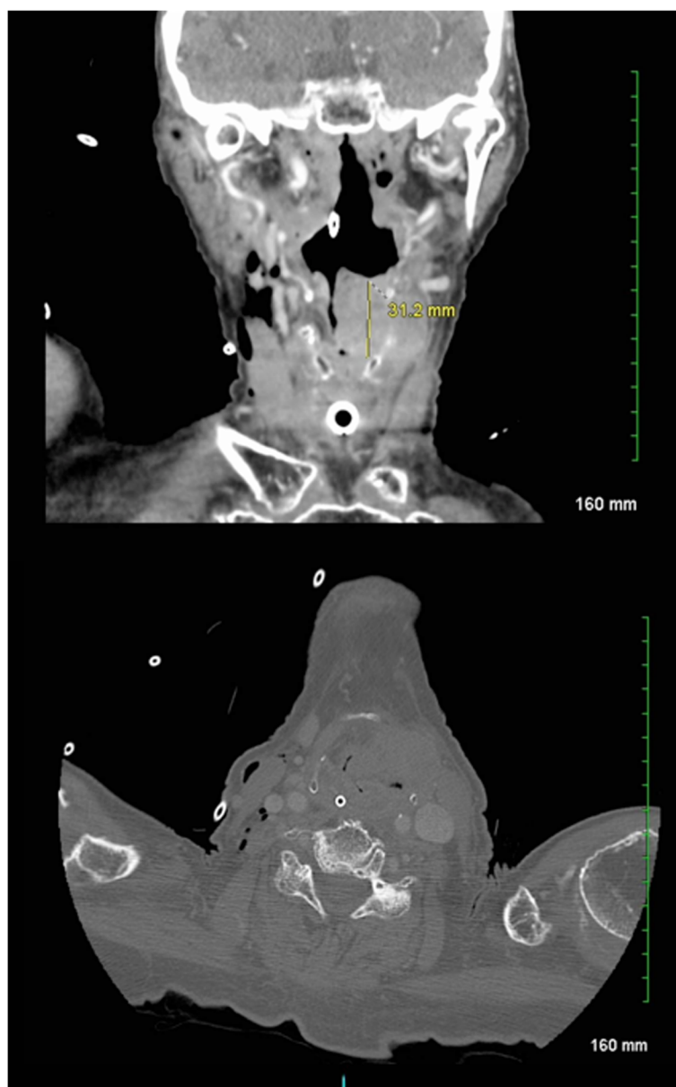
Fig. 1 Initial computed tomography scan of the patient's neck showing left neck mass involving the left supraglottic larynx and extending to the glottis and paraglottic space. The mass extended out through the thyrohyoid membrane and involved the left strap muscle

Eight years earlier, she was diagnosed as having primary Hodgkin lymphoma in a left cervical node. Pathology of the node revealed large atypical cells, Reed–Sternberg cells, and a fine reticular sclerosis pattern. Immunophenotyping performed on a paraffin block demonstrated positive staining of the large atypical cells with cluster of differentiation (CD) 15 and CD30. The stains were negative for leukocyte common antigen (LCA), CD20, EBV-encoded small ribonucleic acid (RNA) (EBER). She was classified as Stage 1A classical Hodgkin lymphoma, mixed cellularity type, which was a rare diagnosis at age 82. Due to her localized disease,