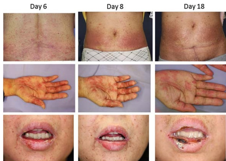
Fig. 2 Progress of eruption. On day 6, erythema with infiltration appeared on the trunk ( upper panel ); blisters containing bloody serum developed on our patient's hands ( middle panel ), and erosive lesions and a furred tongue were observed in her mouth ( lower panel ). On day 8, the erythema became brown ( upper panel ); bullous lesions were observed on her hands ( middle panel ), and mucosal erosion of her mouth continued ( lower panel ). On day 18, the erythema improved, leaving only pigmentation ( upper panel ); the bullous rash was epithelialized with scaling ( middle panel ), and some erosive lesions became blood-filled blisters ( lower panel )

important aspect of preventing acute attacks. However, some porphyrinogenic chemotherapeutic drugs without alternative options might be required for malignant diseases. A list of drugs known to be porphyrinogenic or nonporphyrinogenic according to animal studies and case reports is shown in Table 5 [6]. However, contradicting reports exist for a number of chemotherapeutic agents, including MTX.