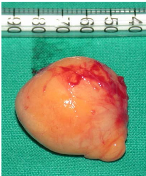
Fig. 3 Enucleated fibrolipoma. On macroscopic examination, the neoplasm appears capsulated, yellowish and soft in consistency, and 40 × 40mm in size

From a connective fibrous capsule originate multiple fibrous bands, that often adhere tenaciously to adjacent tissues and structures, with focally pseudo-infiltrating aspects that may cause doubt of a differential diagnosis with malignant infiltrating lesions.