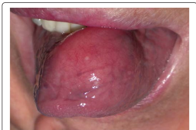
Fig. 1 Tongue fibrolipoma. Our patient presented with a swelling of the anterior two-thirds of the ventral surface of her tongue

On histological examination, the lesion showed clear characteristics of mature adipose tissue, without