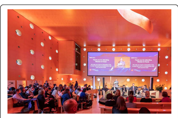
Fig. 1 The "Women in Focus" program took place at the European Congress of Radiology 2019. Over the course of four inspiring sessions, expert speakers and panelists provided their unique insights into leadership, mentoring, life balance, and many other important topics affecting professionals working in healthcare

Morris et al. Insights into Imaging (2020) 11:55 Page 2 of 8