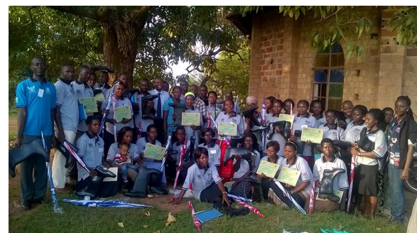
Fig. 1 A group of community health workers in their t-shirts display certificates, umbrellas and gum boots received after a project training

Motivation was enhanced by providing non-financial incentives of t-shirts, umbrellas, gum boots and certificates to all CHWs (Fig. 1), and solar equipment to 75 of them. Monthly mobile telephone credit was provided to