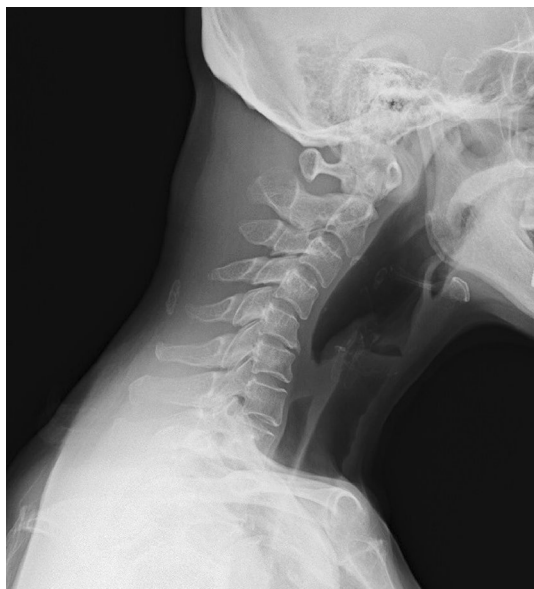
Fig. 2 Lateral radiograph of cervical spine in a neutral position. Plain radiography shows severe cervical kyphosis at the patient's first visit to our department