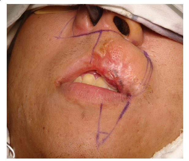
Fig. 2 Recurrence of mucosal melanoma showing pigmented macules and a bulge on upper lip. Flap design for reconstruction

to the above reported literatures, our patient presented with the melanoma on the left side of upper lip.