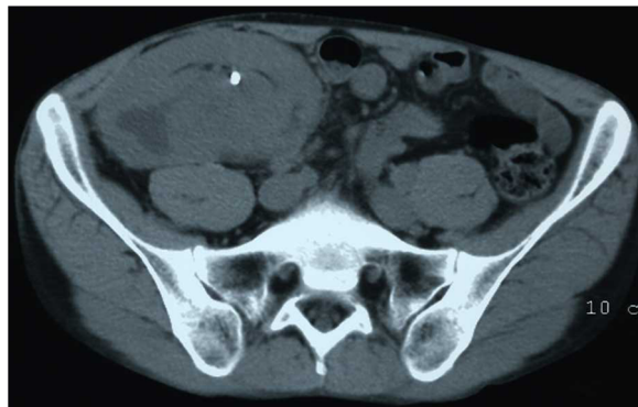
Figure 1 Abdominal computed tomography (CT) scan of the patient. Abdominal CT scan prior to surgery showed a mass measuring 6.4 × 3.7 cm in the transplanted kidney. A double-J ureteral stent was placed.

After the surgery, one course of postoperative GC treatment was administered. Evaluation with chest CT according to RECIST guidelines (version 1.1) showed increased size of the pulmonary metastatic tumors, judged as progressive disease (PD). As a result, paclitaxel/cisplatin/gemcitabine (PCG) combination therapy was started. The PCG protocol consisted of GEM 1,000 mg/m 2 and paclitaxel (PTX) 80 mg/m 2 on non-dialysis days 1 and 8 plus CDDP 35 mg/m 2 on dialysis day 2. This course was repeated every three weeks.