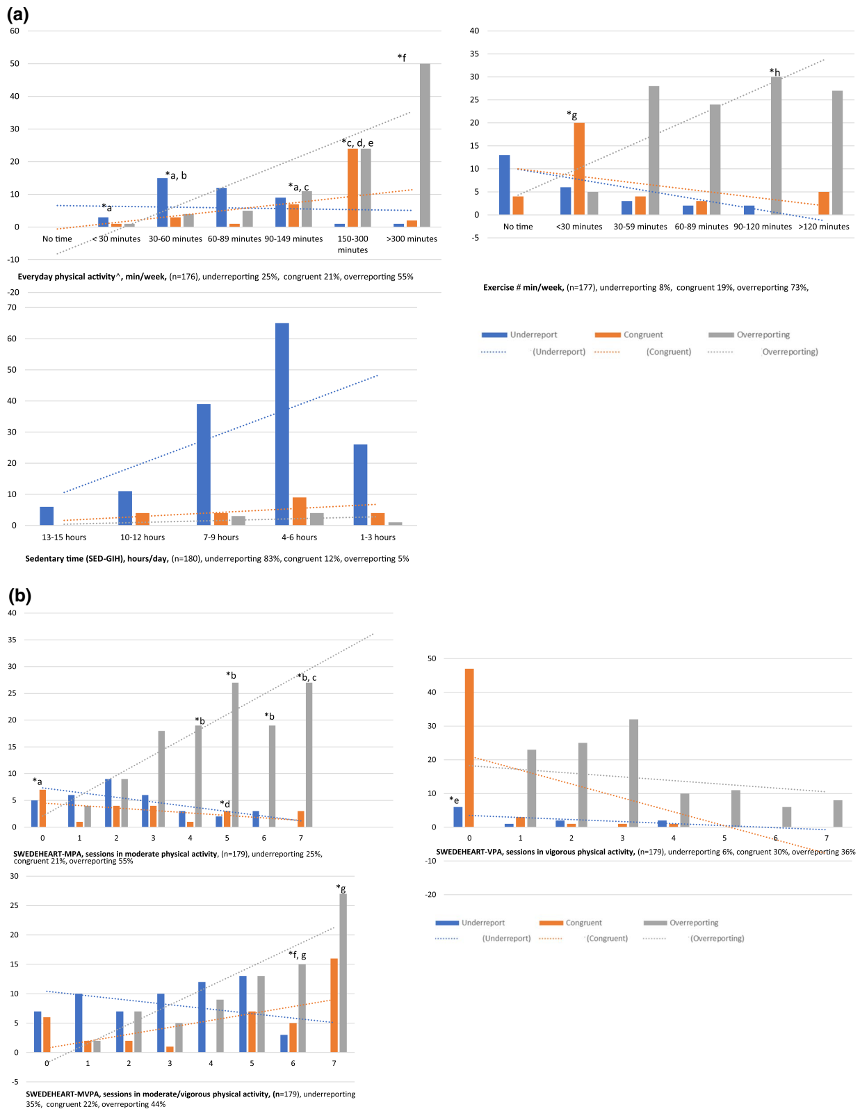
Fig. 2 (See legend on previous page.)