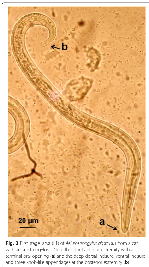
Fig. 2 First stage larva (L1) of Aelurostrongylus abstrusus from a cat with aelurostrongylosis. Note the blunt anterior extremity with a terminal oral opening (a) and the deep dorsal incisure, ventral incisure and three knob-like appendages at the posterior extremity (b)