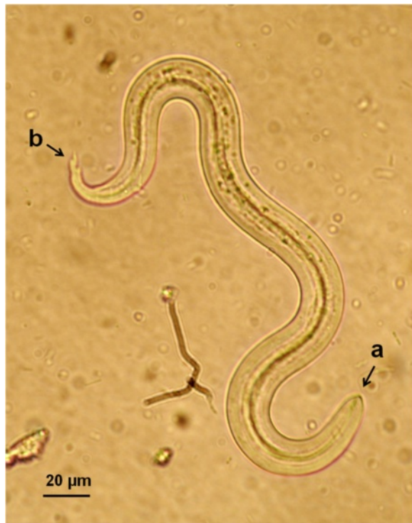
Fig. 3 First stage larva (L1) of Troglstrongylus brevior from a cat with troglstrongylosis. Note the pointed anterior extremity with a subterminal oral opening (a) and the dorsal and ventral incisure at the posterior extremity (b)

The present study adds new knowledge on the geographical distribution of the cat lungworm A. abstrusus in Mediterranean Europe, as no updated and multi-site information were available for Greece and no data were obtained for the study areas thus far. It is here shown that cat aelurostrongylosis may occur with relatively high infection rates in some parts of Greece (Table 1), i.e. higher than the values previously recorded in the north of the country [6]. The only information available for T. brevior in Greece is a single case report from Crete [11]. This current study shows that this nematode can infect free-roaming domestic cats in continental Greece and islands other than Crete, in a range of latitudes extending from 35°51'N (Crete) to 39°12'N (Skopelos) and longitudes from 23°72'E (Athens) to 25°35'E (Mykonos). Interestingly, both A. abstrusus and T. brevior were found in varying environments, e.g. dry (Mykonos), forested (Skopelos) and highly urbanised (Athens) areas. It is important to note that the dry climate and poor vegetation characterising Mykonos and the urban environment of Athens do not represent an obstacle to the life-cycle of these mollusc-transmitted nematodes. On the contrary, the highest presence of both lungworms was recorded in these two study areas, thus indicating that the life-cycle of feline lungworms can be completed, as long as even limited habitats ensure the required conditions for the larval and intermediate host survival.