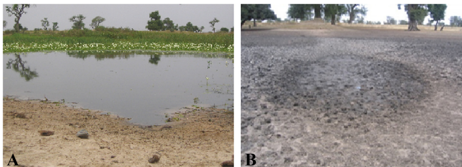
Fig. 2 Pictures showing the water bodies of the Niakhar area: a filled pond from July to November (a) and a dry pond from December to June (b)

total number of snails tested represent the infestation rate.