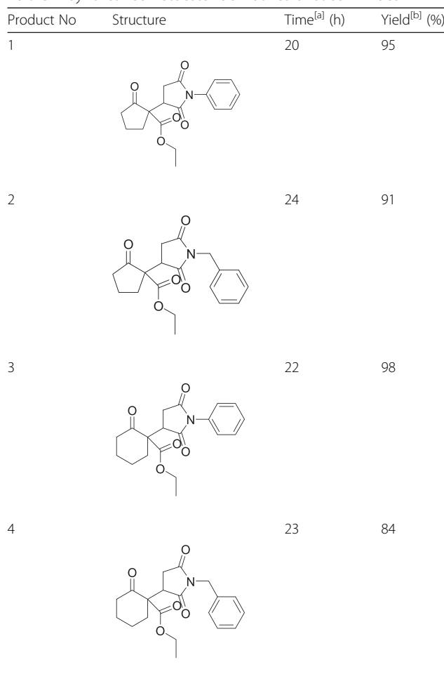
Table 1 Synthesized ketoester derivatives of succinimides

[a] Time of reaction completion; [b] Isolated yield after column chromatography