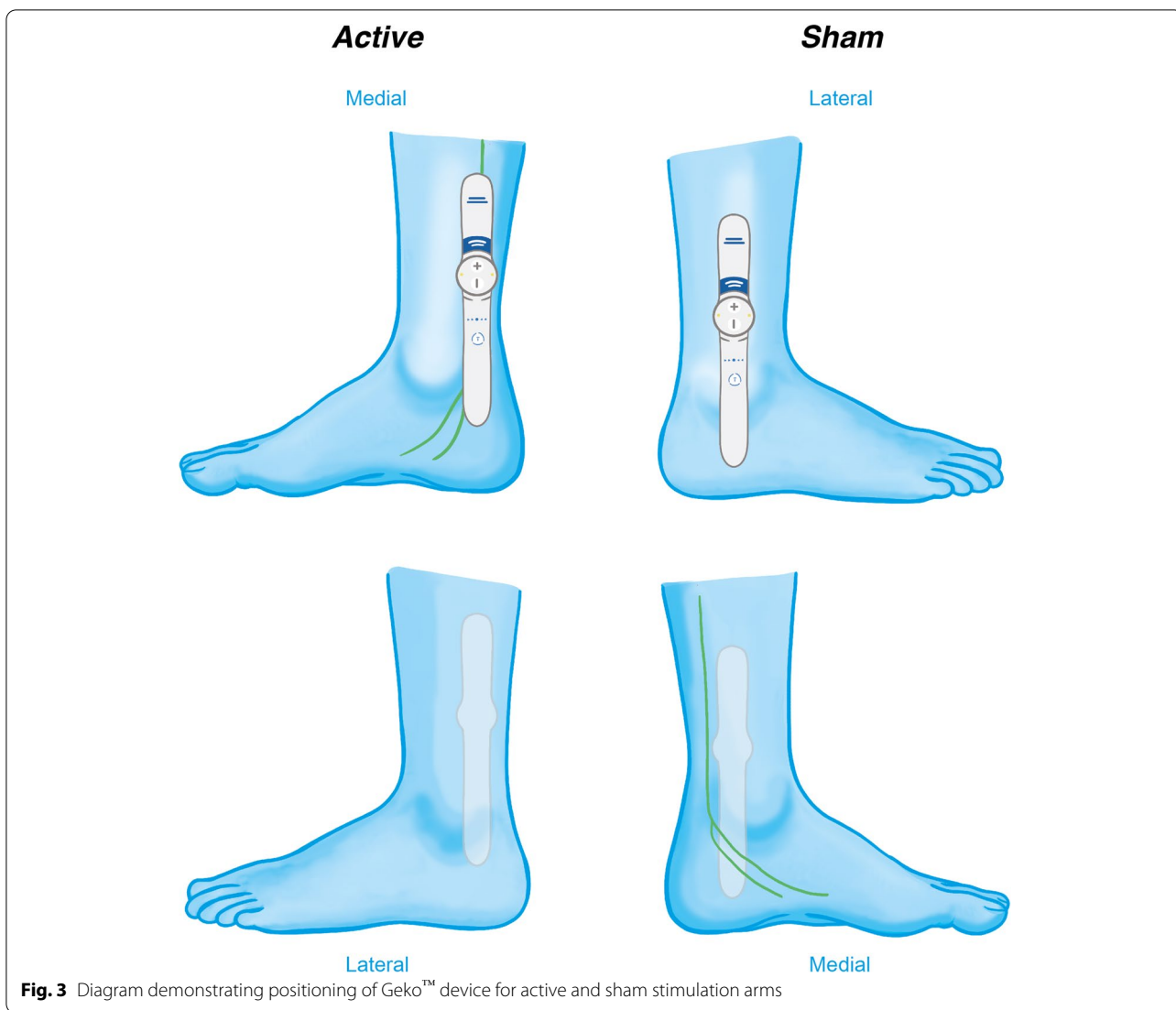
Fig. 3 Diagram demonstrating positioning of Geko™ device for active and sham stimulation arms

months is a criterion for exclusion but will not preclude recruitment once the 3-month timepoint is reached.