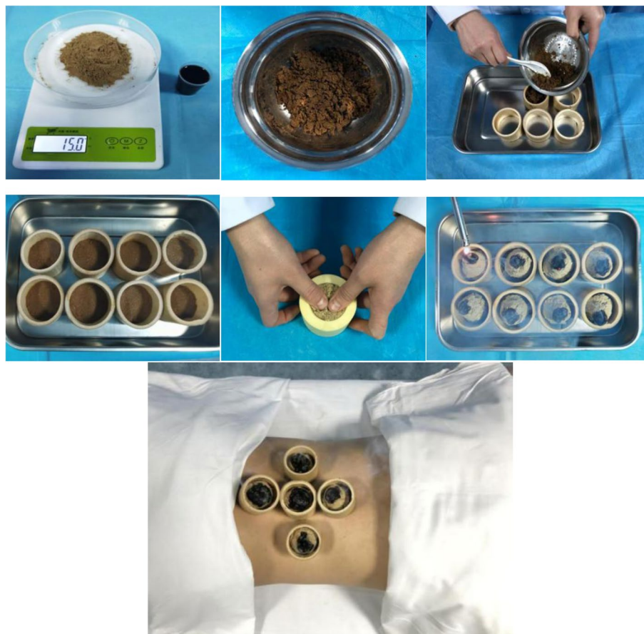
Fig. 3 The operation process of Ma's bamboo-based medicinal moxibustion

The selection of acupoints for the acupuncture group will follow according to the major acupuncture point prescription in the Evidence-Based Guidelines of Clinical Practice with Acupuncture and Moxibustion Low Back Pain [20], with positioning based on Nomenclature and Location of Acupuncture Points (GB/T 12346-2006) [19]. Each patient will be instructed to take the prone position. Disposable sterile needles of 0.30×40mm and 0.30×50mm (Suzhou Medical Appliance Co., Ltd., Suzhou, Jiangsu, China) will be used for the Shenshu (BL23), Dachangshu (BL25), Weizhong (BL40), L1-L5Jiaji (EX-B2), and Ashi points. The therapists will strictly follow the basic puncture methods and techniques in China's acupuncture operating specifications for treatment [21, 22]. After insertion of the needle, basic lifting and