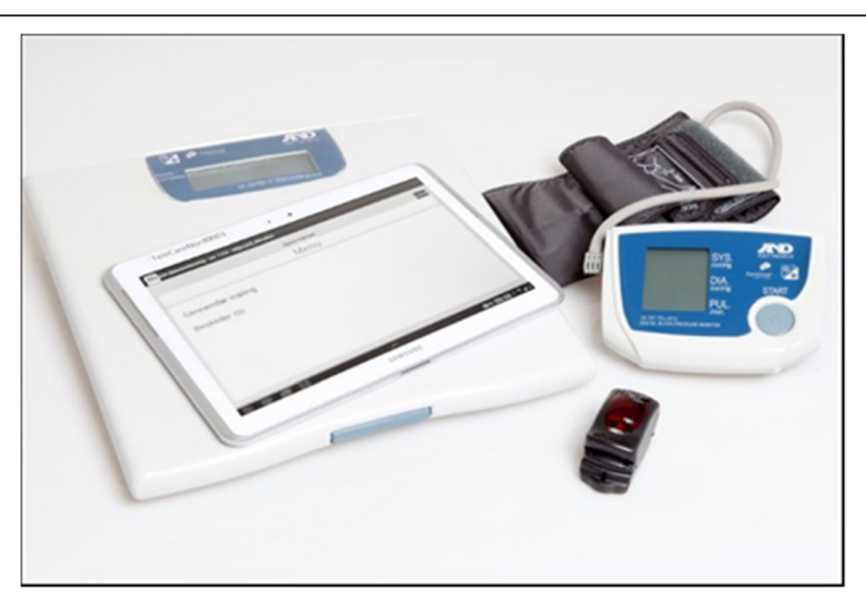
Fig. 1 The telehealth system, Telekit, consists of a tablet, a fingertip pulse oximeter, a blood pressure monitor, and a scale

The commercial and CE-marked telehealth system represents an open-source platform that collects health data and provides remote care for the patients with COPD. The telehealth system is based on a mobile- and webbased healthcare platform of which, the mobile platform is used by patients with COPD to measure their vital signs (blood pressure, oxygen saturation, pulse, and weight) and answer questions related to subjective parameters (such as shortness of breath, color of mucus) at home twice a week. The measurements and questions are then transferred wirelessly to specialized COPD community nurses. The specialized COPD community nurses use the web-based portal to monitor the patients' health data on a weekly basis (measurements are typically reviewed Monday or Thursday) based on preset fixed alarms [43]. These preset fixed alarms are triggered by "too high" or "too low" single values of physiological parameters (oxygen saturation, pulse, blood pressure, and weight) that can be changed according to the individual needs. The specialized COPD community nurses are responsible for monitoring the patients' vital signs and provide telephone advices over