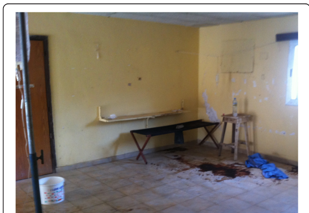
Fig. 1 West African Ebola Treatment Facility—April 2014

a Medical management (including utilization of invasive therapies) is described in peer-reviewed format (Table 3) and in reference [40] LOS length of stay (days), N/A not available