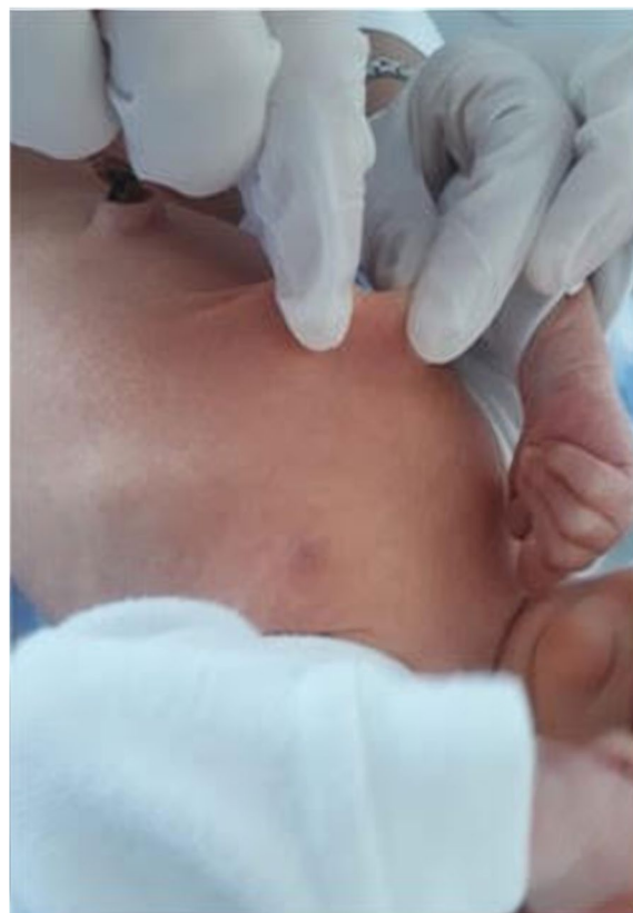
Fig. 3 Patient 1: lax skin

ophthalmic evaluation, echocardiography and abdominal ultrasound scan were requested. The ophthalmic evaluation confirmed the exotropia and did not find any other abnormalities, as well as the abdominal ultrasound. Instead, the echocardiography revealed an aortic root dilatation at the aortic sinus of 13 mm (Z score +3) without aortic insufficiency. The remaining segments of the aorta appeared within limits. The patient also presented patent foramen ovale and ductus arteriosus, with a hemodynamically not significant left-to-right shunt. After the genetic evaluation, a trio based Whole Exome Sequencing (WES) was performed finding a novel, heterozygote, missense, de novo variant (c.1378C>G, p.(Arg460Gly) in the TGFBR2 (NM_003242.5) gene.