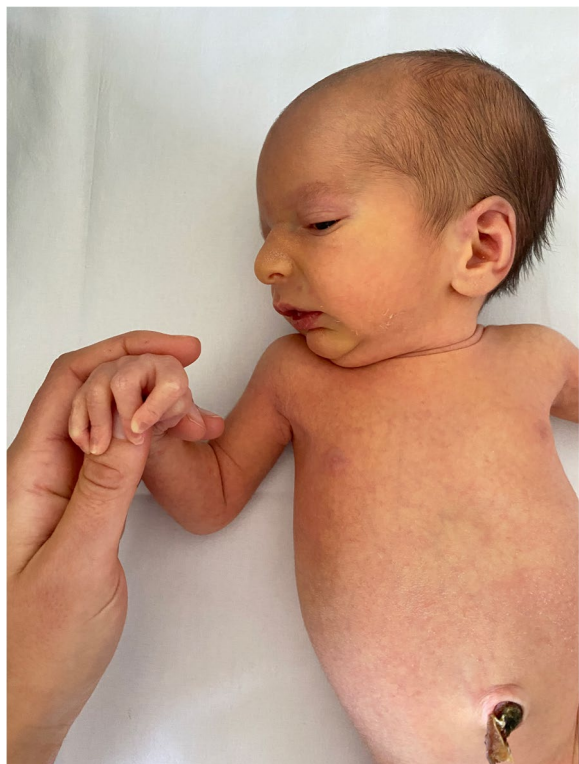
Fig. 2 Patient 1: senile appearance