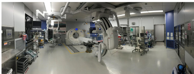
Fig. 1 A photograph of rotated type hybrid ER system (Canon Medical Systems Corp., Ohtawara, Japan). C-arm is located on the wall at the opposite side of the CT gantry; therefore, this system can secure wide working space in resuscitation phase

Our hybrid ER system has an air-conditioned operating room (class 10,000), but many hybrid ER systems are not air conditioned. Moreover, the patient table in our hybrid ER system consists of an operating table, whereas that in other hybrid ER systems consist of interventional radiology table. Our hybrid ER is installed in the emergency department, but it is a complete operating room.