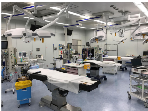
Fig. 3 A photograph showing a trauma bay including three additional beds next to the hybrid ER. An air-conditioned operating room is also found in this area. (class 10,000)

CT: computed tomography; Hybrid ER: hybrid emergency room; IVR: interventional radiology